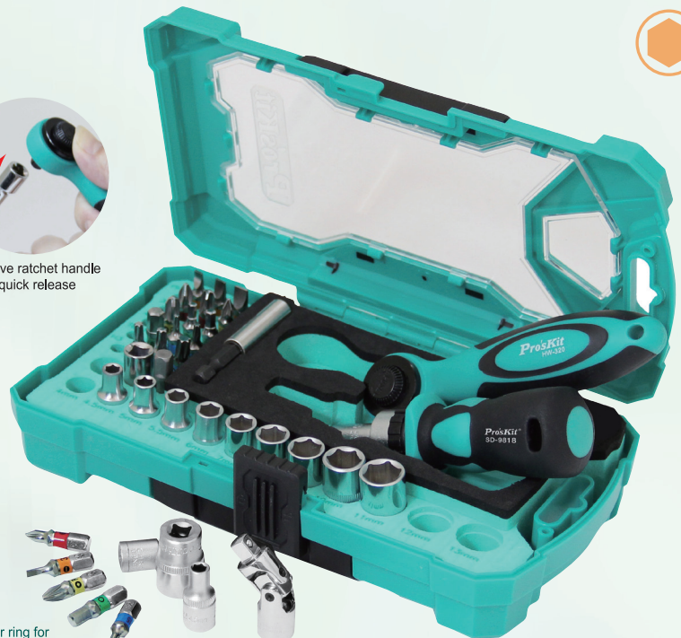
Bits with color ring for easy spec' identification