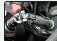
Operate with universal joint to fit for different angle use