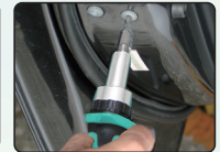
Ratchet screwdriver handle provide optimum torque