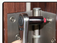
72 teeth 2-way ratchet stainless steel handle