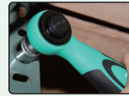
Ideal for auto mechanic or home DIY repair and more